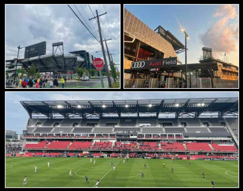
Check out Audi Field that's home to the DC soccer teams, DC United (men's soccer team) and Washington Spirit (women's soccer team). Located on Potomac Ave SW near the South Capitol Street bridge (now the Frederick Douglass Memorial Bridge).